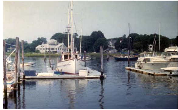
Figure 3. Recreational boaters, commercial fishers, coastal landowners, and coastal visitors are often competing for space in the heavily used waterways of the Northeastern United States. Wickford Harbor in Rhode Island is typical of many coastal waterways with multiple constituency groups who must not be overlooked when planning and operating a shellfish aquaculture operation.

Quantification of the value of aesthetics and other environmental and social non-market values is often a difficult and imprecise task, though estimates can greatly assist decision makers. For example, Johnston et al.