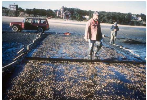
Figure 2. Shellfish farmer Joel Fox in a typical northern quahog, Mercenaria mercenaria , farm plot in Wellfleet, Massachusetts. Extensive sand flats during low tide are cultivated before planting hatchery-reared seed at about 50 clams/sq. ft. To protect against predation, netting is rolled out to cover the entire plot and either fastened to submerged rebar or nailed to boards buried in the sediments. The quahog aquaculture industry in Wellfleet has a long-standing reputation of cordial relations with seaside homeowners.

tecting against predators (Figure 2). Studies of impacts of this type of shellfish farming in England using the Manila clam Tapes philippinarum have shown buildup of fouling organisms on the netting and a concomitant increase in grazing molluscs and juvenile fish associated with the nets (Spencer et al. 1996). While preparation of the beds and harvesting of clams from the plots by various mechanical plows or hydraulic devices disrupts infaunal communities, recovery is rapid with original communities returning in less than a year (Spencer et al. 1998). Disturbance and accidental take of non-target organisms is unavoidable regardless of bed preparation and harvest mechanism; however, in the majority of cases increased diversity and abundance of species living in nooks and crannies of all shellfish compensates for temporary losses (Kaiser et al. 1996).