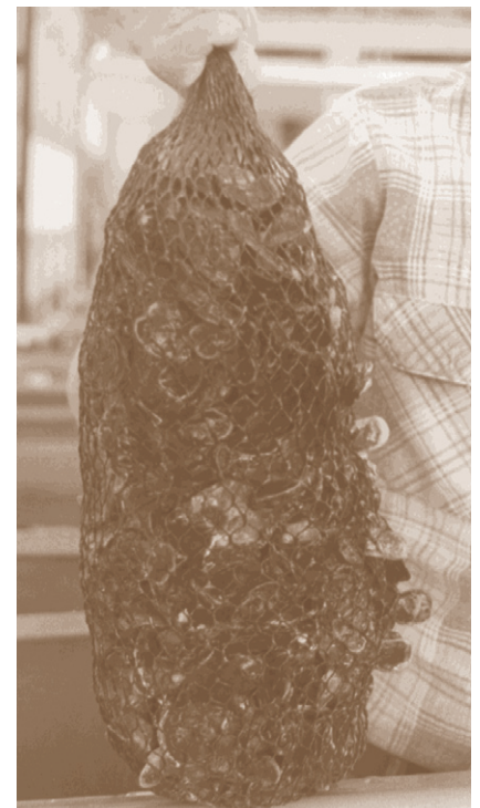
Oyster netting is a common shellbag material.

Important considerations in choosing cultch containers are that they be nontoxic and sturdy and that they allow for good water flow to oyster larvae. The kind of container and its size may influence the type of setting tank you use; most importantly, it will determine your labor and equipment needs in filling, transporting and planting, factors that all affect profitability. A container with cultch weighing 30 pounds will weigh approximately 40 pounds when retrieved from the nursery area; this increased weight is the result of oyster seed, sediments, and fouling. The added weight must be considered in whether you use machinery or hand labor. Handling small containers may