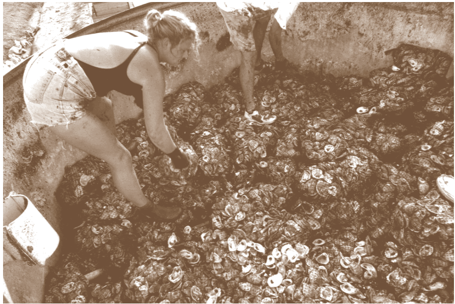
Large fiberglass cylindrical tank for holding cultch containers — in this example, containers are bags of shell.

Many sizes and types of remote setting tanks have been used successfully. Large tanks will minimize the number of settings