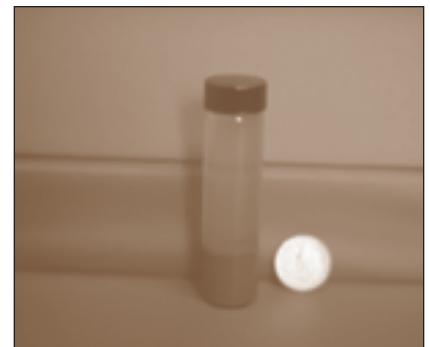
A capsule of one million eyed larvae.

Introduction Selection of setting and nursery sites Cultch selection and preparation Cultch containers Setting equipment Water delivery Preparing the setting tank Adding larvae to the tank Feeding oyster larvae Record keeping Cleaning the tank Nursery area Planting in production beds Summary