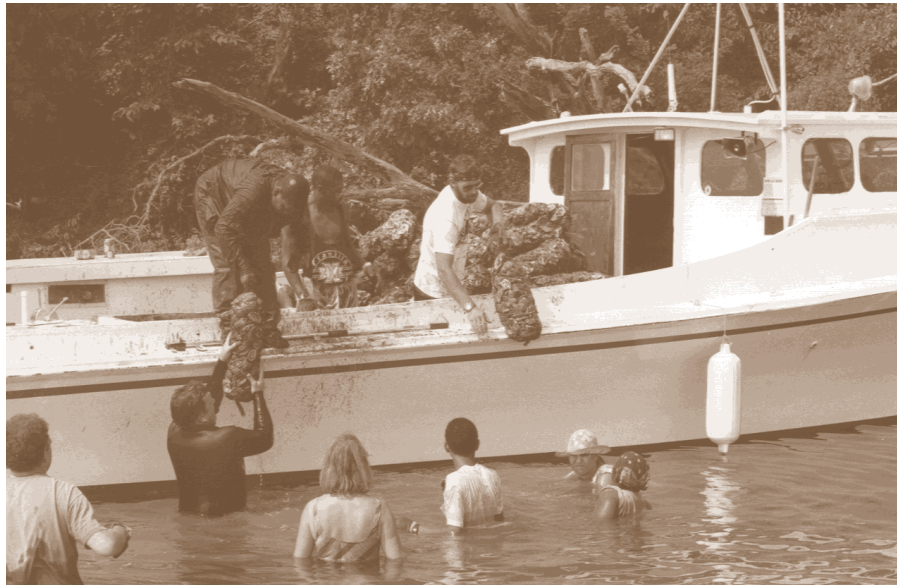
Planting oysters in a protected area.

While stacking protects seed from exposure and improves survival, it increases the need to monitor the nursery. Sediments carried by water may settle out among the cultch, smothering the small seed. Be on the lookout for