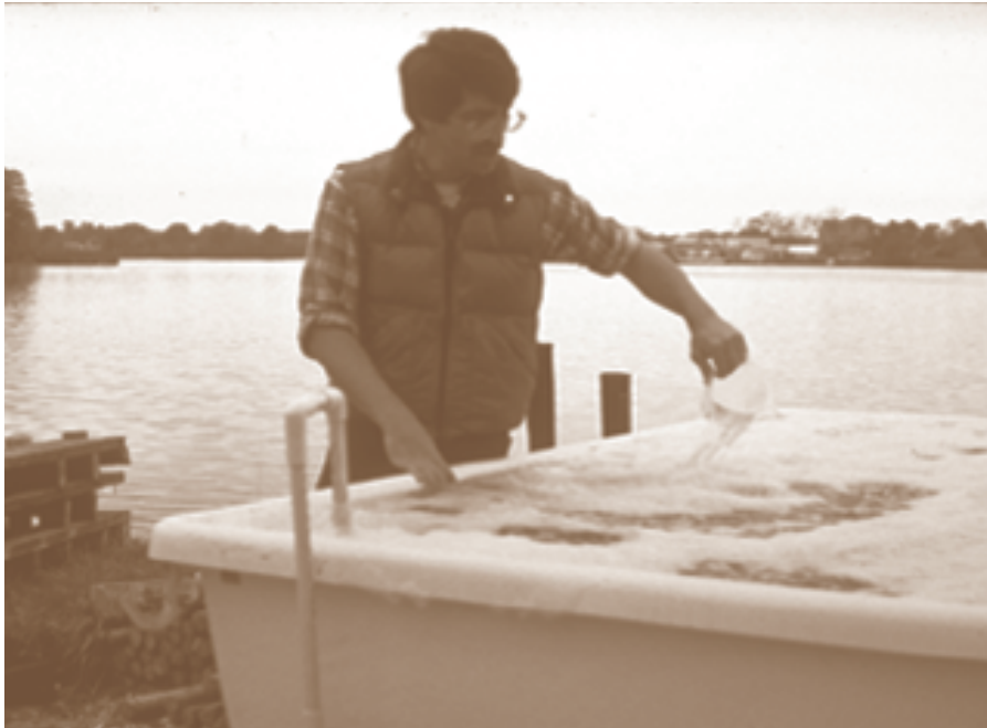
Oyster larvae are distributed by spreading them across the surface of the tank.

settlement occurs during the first day. Metamorphosis of settled larvae to spat takes about another day. Most larval energy reserves have been drained during this process. Thus, allowing the young oysters to recover for a few days in the tank will improve their chances of survival during the stress of being moved to a nursery area.