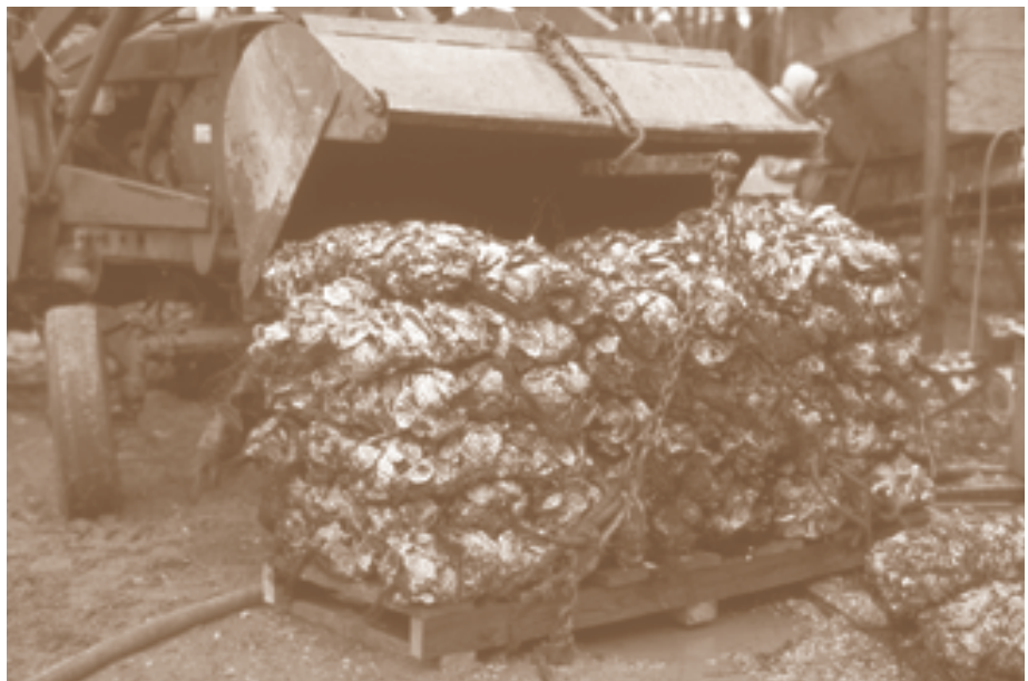
Pallets can provide a foundation for stacking cultch containers on bottom grounds.

Clean your setting tank after every use. A few oysters will inevitably settle on the tank itself; if the tank is used often, they may be able to survive and grow. These oysters compete with the smaller oysters for food, and produce waste products in the tank. Consequently, it is important to remove them. Scrub the sides and bottom with a stiff brush. Sponging off the aeration system and rinsing the unit thoroughly is all that is necessary — it is easiest to do this after you've emptied the tank and it is still wet. It is also good practice to allow the tank to dry in the sunlight before being used again. Scrubbing with a diluted bleach solution may prevent persistent growth on the tank, but rinse thoroughly and use bleach only in a well ventilated area.