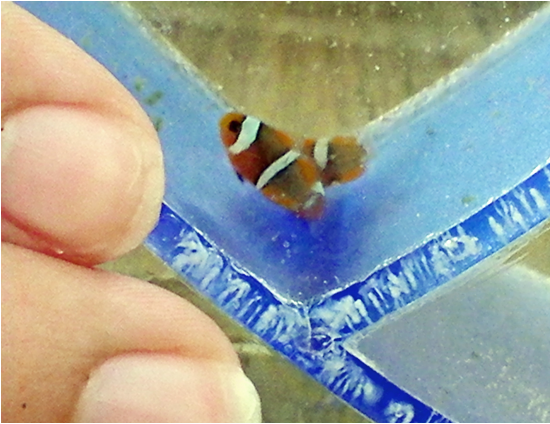
Photo 1. A 3 week-old clownfish ( Amphiprion ocellaris ) at Westminster High School will become one of the broodstock to produce other clowns for CCPS schools involved in Science Research courses.

At Westminster High School in Carroll County, Maryland, a greenhouse is full of more than plants or veggies being readied for a spring fundraiser -- it is full of discovery and ideas. The interior of the six-year old greenhouse is humming with the sounds of pumps, compressed air, and other life support systems that enable students in Science Research courses to design experiments, ask questions, and get into science in a way that is all too often out of reach.