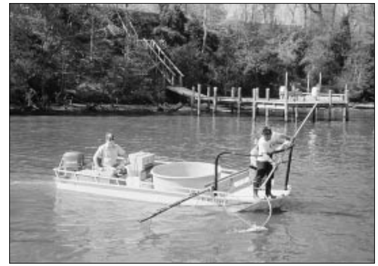
To provide the industry with striped bass seed, hatchery operators depend on collecting gravid striped bass from the wild, usually by electroshocking.

Everyone agrees that such dependence is unacceptable. For some time, researchers have been trying to "trick" striped bass into developing and spawning eggs by maintaining them in tanks with simulated environmental conditions — especially daylight and temperatures, as well as Continued on page 4