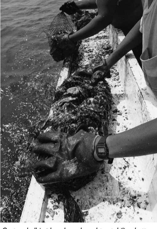
Oyster shell is placed overboard to stabilize bottom grounds and provide a firm substrate for planting oyster seed.

Dredge shell is usually not as expensive to move because it is transported in large bulk loads. In fact, if you can get it at the same time that the State of Maryland is moving shell into your area for the public repletion program, you may be able to cut your costs significantly. It is always easier for the